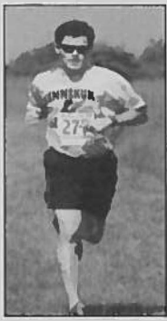
Benny Branson Memorial 4.4 Run